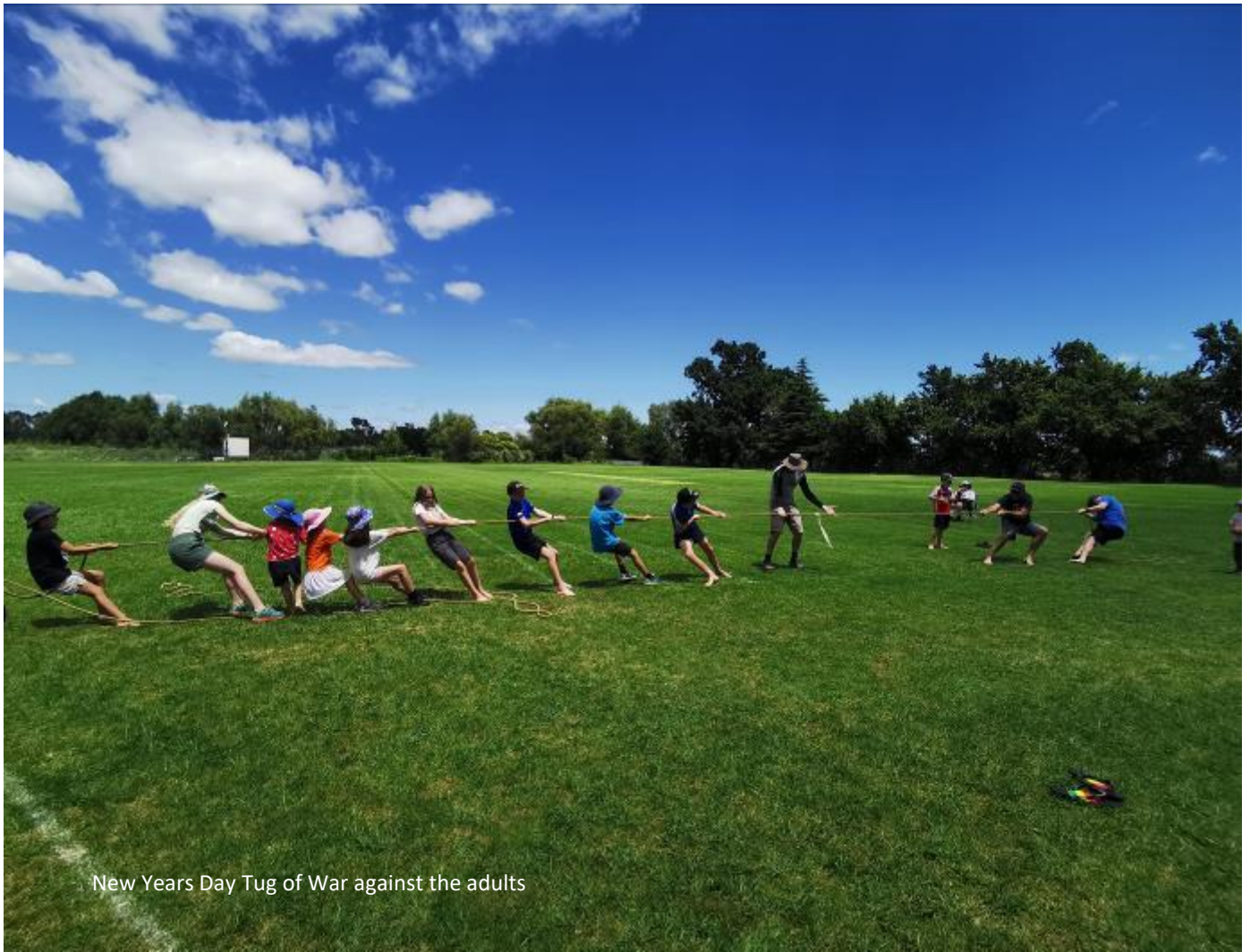
New Years Day Tug of War against the adults