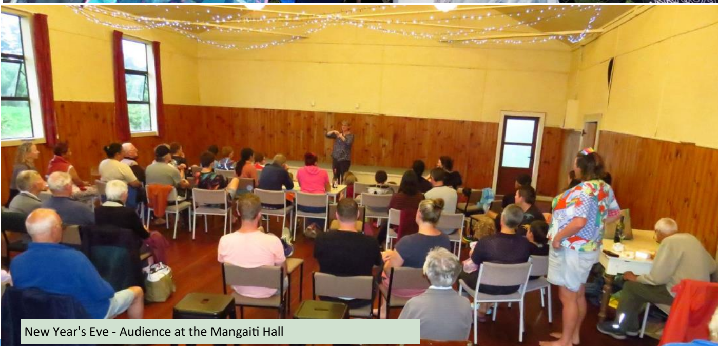
New Year's Eve - Audience at the Mangaiti Hall