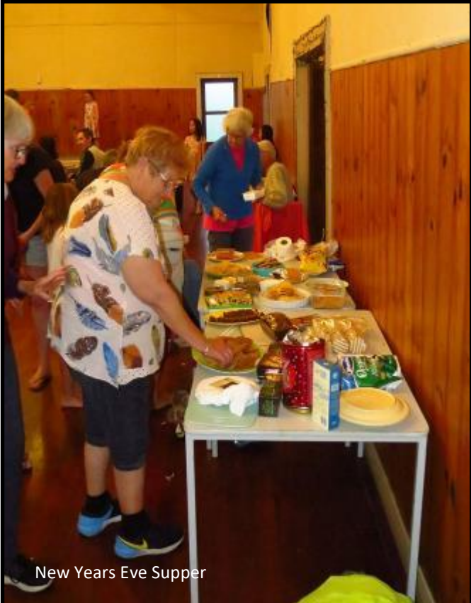
New Years Eve Supper