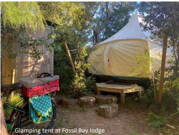
Glamping tent at Fossil Bay lodge

We unpacked our bags and headed off on an island bike adventure. First stop, Palm beach for an ocean dip, via the Oneroa Art Gallery. Next a delightful bike in the rain to the fabulous Casito Miro vineyard in Onetangi to taste some delicious food and wine. Then on to Wild on Waiheke for a dance and some more wine. Finally, a cycle trip back to Oneroa to Fenice Italian restaurant for cocktails and Pizza and a swim on the way home to end the day.