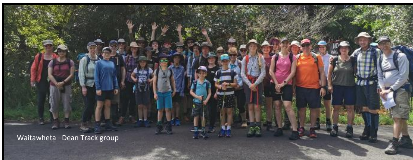
Waitawheta –Dean Track group