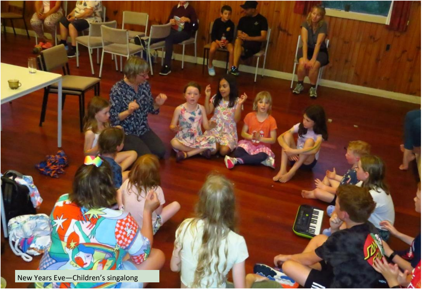
New Years Eve—Children's singalong