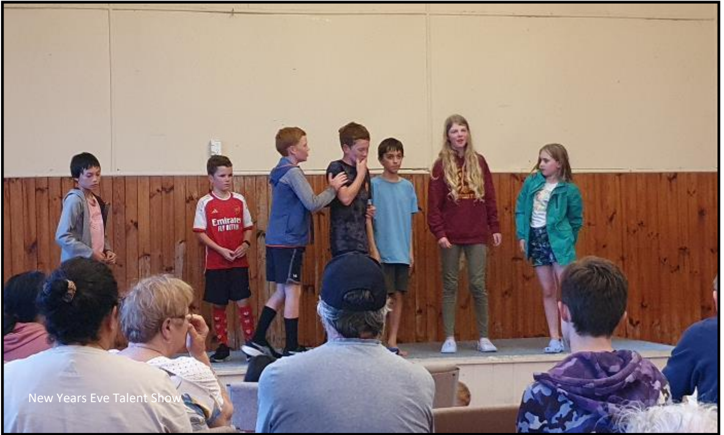
New Years Eve Talent Show