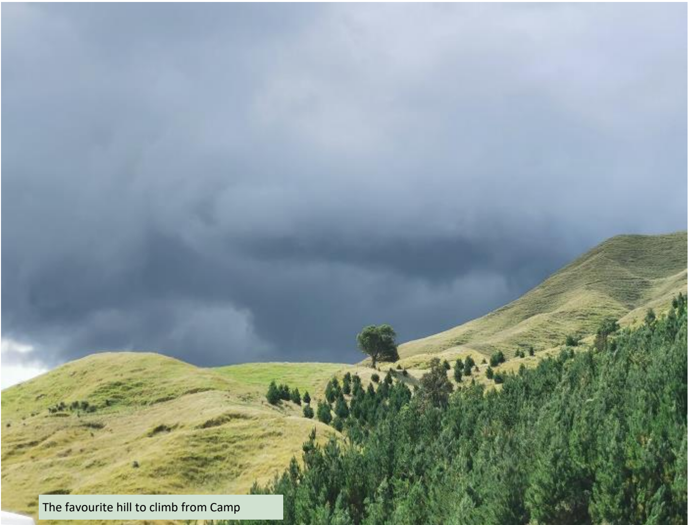
The favourite hill to climb from Camp